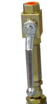
HIGH PRESSURE BALL VALVE HPBV38